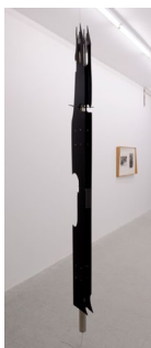
Valerie Keane 'Private Venus', 2014 Acrylic, chromed steel, aircraft cable, cable ties, arakawa grip 95 x 6 x 2.5 inches