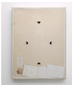
Bradley Kronz 'Untitled', 2014 Acrylic box, racoon patch, cardboard, photographs 24.5 x 18 x 1 inches