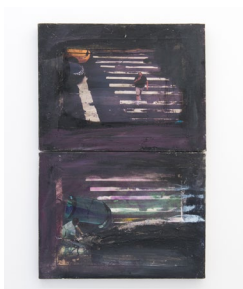
Mary Ann Aitken 'Untitled (crosswalk diptych 1)', 2005 Oil and collage on canvas 22 x 14 x 1 inches