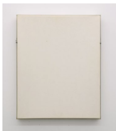
Bradley Kronz 'Untitled', 2014 Acrylic box, cardboard, photographs 20 x 16 x 1 inches