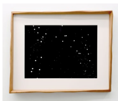
Oto Gillen 'Two Dancers', 2014 Silver gelatin print, cherry wood, uv glass, mat board 26 x 21 x 3 inches