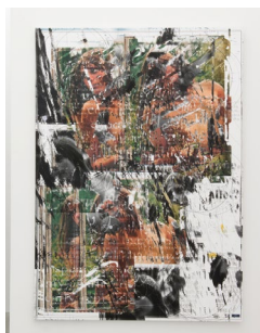
Jason Matthew Lee 'Lena 1', 2014 Archival inkjet, uv protective varnish, security stickers, electrical soldering alloy, on canvas 38 x 54 x 1 inches