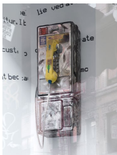
Jason Matthre Lee 'Bruteforcephreak', 2014 Payphone, magnets 21 x 7.5 x 6 inches